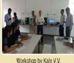
Workshop by Kale V.V. on "PCB Designing"