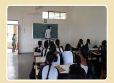
"Teachers Day" Celebrated with Great Enthusiasm