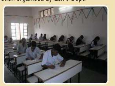
Poster Presentation & Aptitude Test organised by Mechanical Engineering Dept.