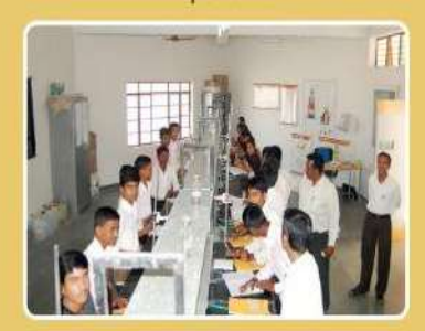
Physics & Chemistry Lab