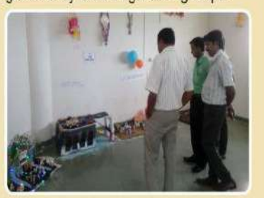
Poster Presentation & Art Exhibition organised by Computer Engineering Dept.