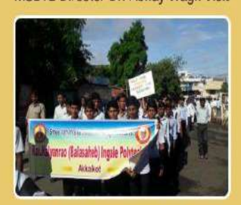
General Awareness Rally