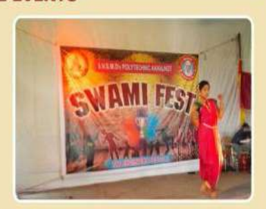
Swami Fest 2k16