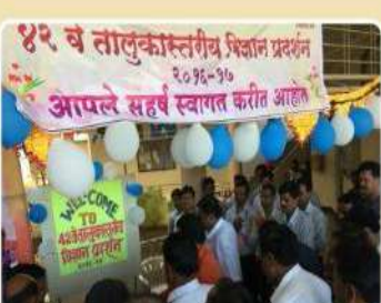
42nd Science Exhibition